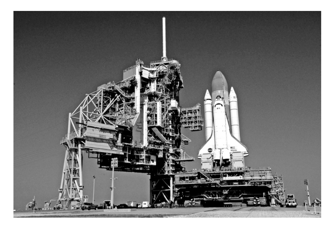
Fig. 7.5 Space Shuttle, mobile launcher platform and rotating service structure

The Shuttle has the most reliable launch record of any rocket now in operation. Since 1981, it has boosted more than 1.36 million kilograms (3 million pounds) of cargo into orbit. More than 600 crew members have flown on its missions. Although it has been in operation for almost 30 years, the Shuttle has continually evolved and is significantly different today than when it first was launched. NASA has made literally thousands of major and minor modifications to the original design that have made it safer, more reliable and more capable today than ever before.