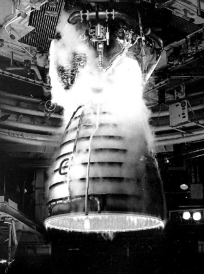
Fig. 7.6 Space Shutttle propulsion systems