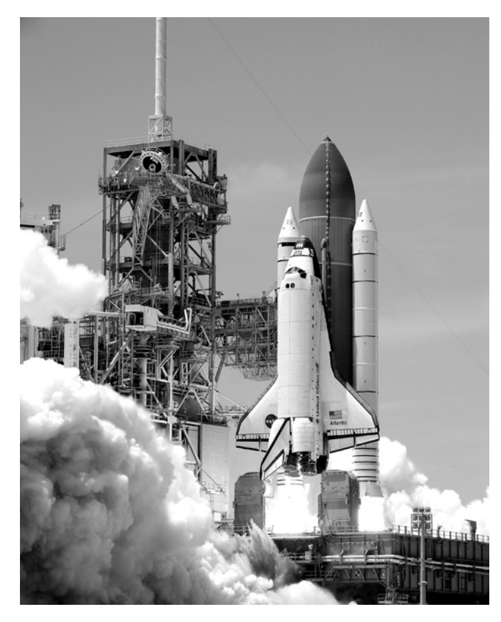
Fig. 7.7 Space Shuttle launch